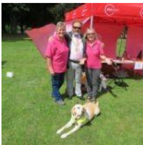
Pictured with the Mayor while promoting Childminding at the National Play Day Abington Park August 2016

We operate the enquiry line between 9-5 every working day and can also be contacted by email. We also support all childminders through updating information and Face Book pages on our websites www.childmindingnorthants.org.uk and www.childmindinguk.com